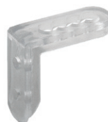
type D (clear)