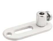
type A (colour)