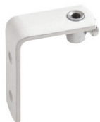
type B (colour)