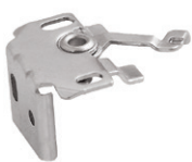
type A - universal (standard)