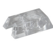
type C (clear)