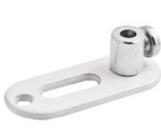
type A (colour)