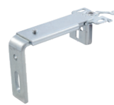
type D - adjustable 80/120 (zinc coated/colour)