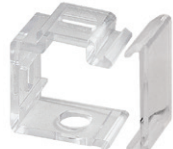
type C (clear/white)