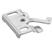
type B - ceiling